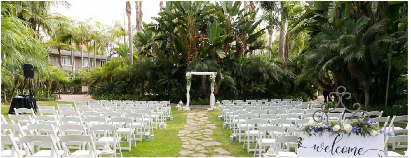
TROPICAL COURTYARD | Maximum seating of 120 guests | $1,000