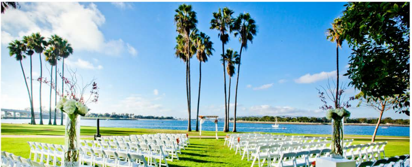
SUNSET LAWN | Maximum seating of 300 guests | $2,000