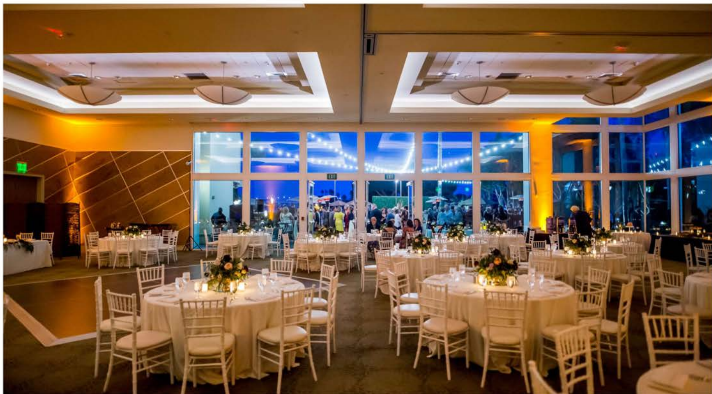
MISSION BAY BALLROOM | Maximum seating of 250 guests