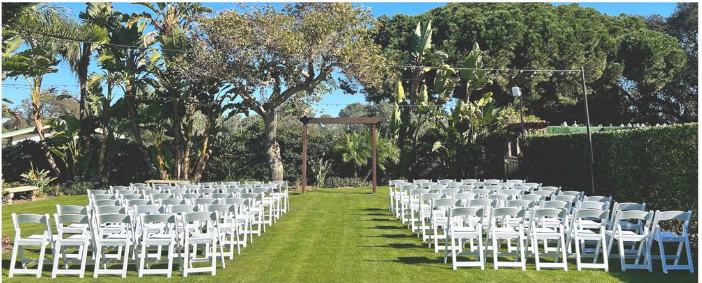
MARINA GARDEN | Maximum seating of 300 guests | $1,500